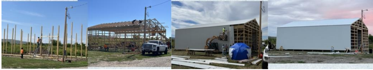
Building progression from before the team from Tennessee came, to when to right before they finished.